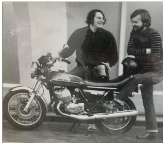
1973 Lafayette Park, Detroit

Detroit All-City Football Offensive Lineman Recruited by United States Air Force Academy