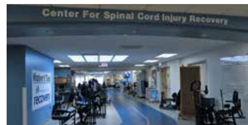
Center for Spinal Cord Injury Recovery.