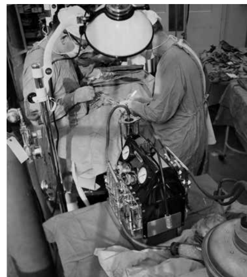
First Mechanical Heart 1952 performed at Harper Hospital.