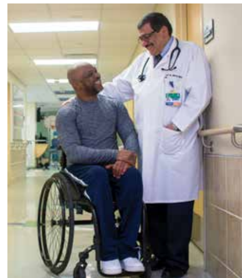
Rehabilitation Institute of Michigan.