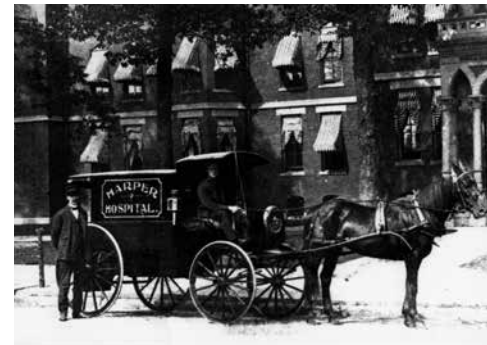
Horse Drawn Ambulance 1890.