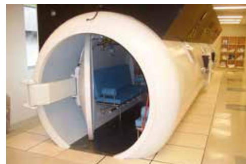
Detroit Receiving opens 24/7 hyperbaric oxygen program.