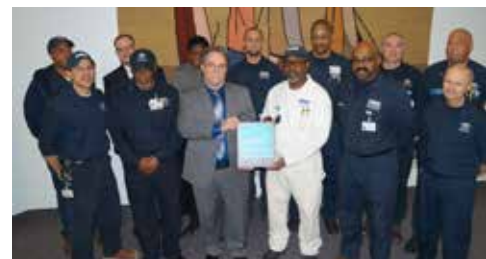
DMC Detroit Receiving Hospital receives Energy Star Certification for a second year in a row.