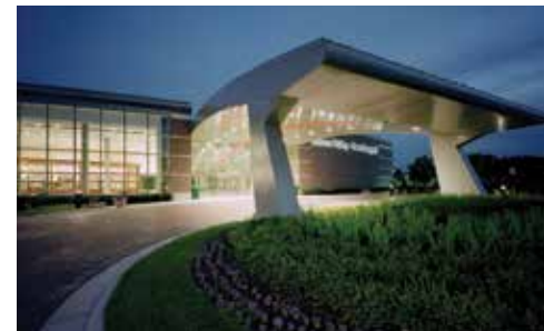
DMC Huron Valley-Sinai Hospital est. 1986.