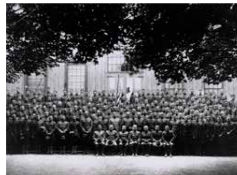
Harper's Base Hospital #17 Medical Staff 1917 World War I.