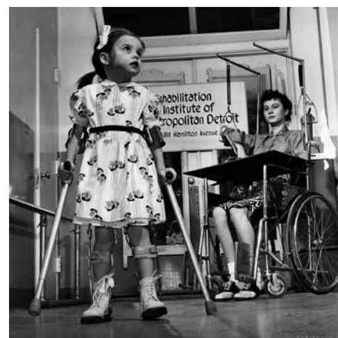
RIM est.1951, Michigan's first freestanding hospital dedicated to rehabilitation medicine.