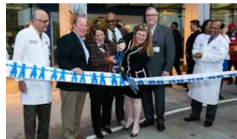
Children's Hospital of Michigan NEW Hospital Grand Opening.